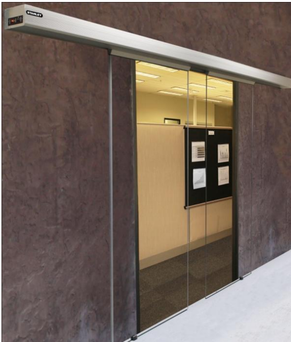
Stanley Automatic Sliding System

The system is equipped with the basic operating functions and safety features that will meet the international requirements for Automatic sliding system.